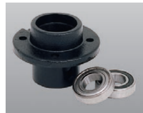
All AFM's feature blade spindles and bearings precision fit in a cast iron housing.

Getting the 3 big decks going all at once is a big chore. A great deal of torque is transmitted from the tractor to get all the blades in motion. That is why we use drivelines with slip-clutch protection, cast iron gearboxes with high quality seals and bearings, and a 3/8" steel plate to support the gearbox.